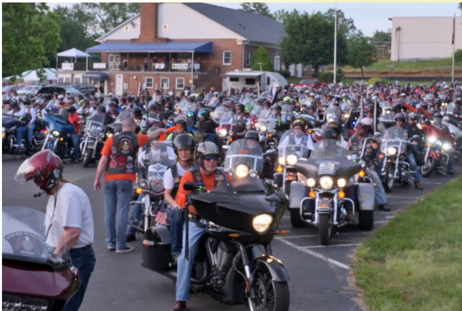
Riders stage at American Legion Post 177 Memorial Day Weekend, 2018.

Run to the Thunder is Memorial Day weekend, May 28-29, 2022. The Post 177 American Legion Riders Run to the Thunder mission is to provide a friendly atmosphere for our brothers and sisters-in-arms, and to offer escorted rides, meals, and other activities over the weekend. On Sunday morning of Memorial Day Weekend, our plan is to link up with "Ride of the Patriots" in Fairfax, Virginia. From there, we'll be escorted to join the "Rolling to Remember" rally point at RFK Stadium in Washington DC.