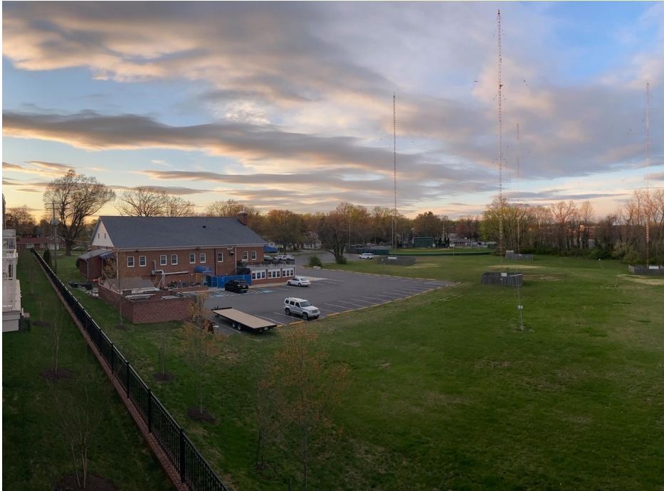
A shot of the Post at the start of the pandemic shut down