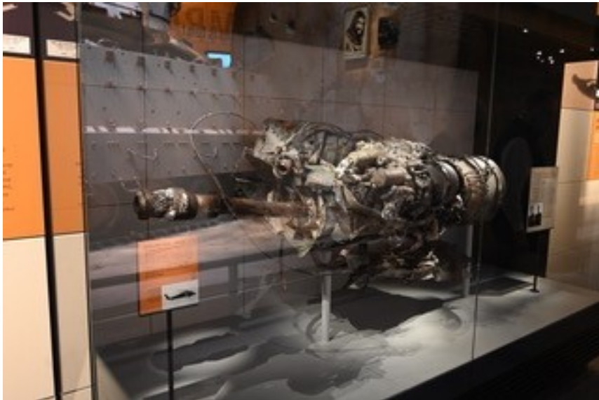
One engine from the Blackhawk helicopter from Delta Force raid in Somalia – “Black Hawk Down”