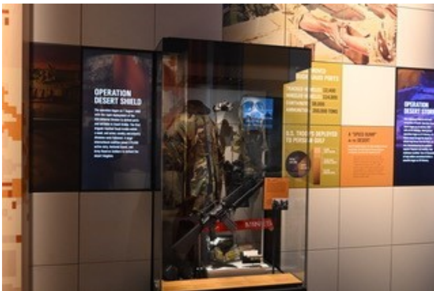
Operation Desert Shield uniforms and soldiers weapons