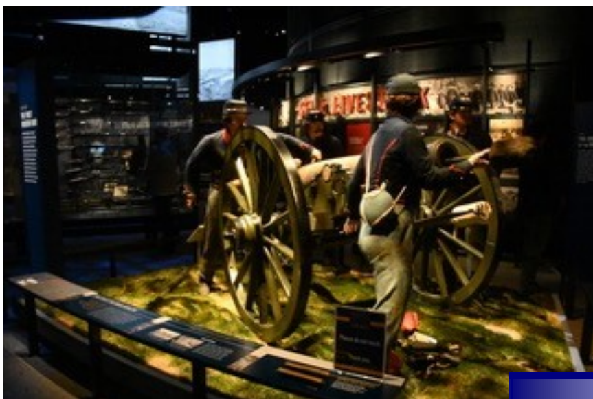
Civil War soldiers moving the large cannon during winter storm for upcoming battle