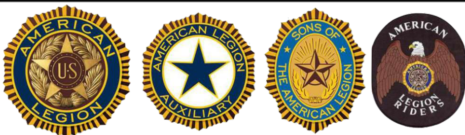
The American Legion Family