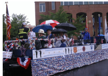
Post 177's float