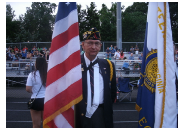
Post Color Guard