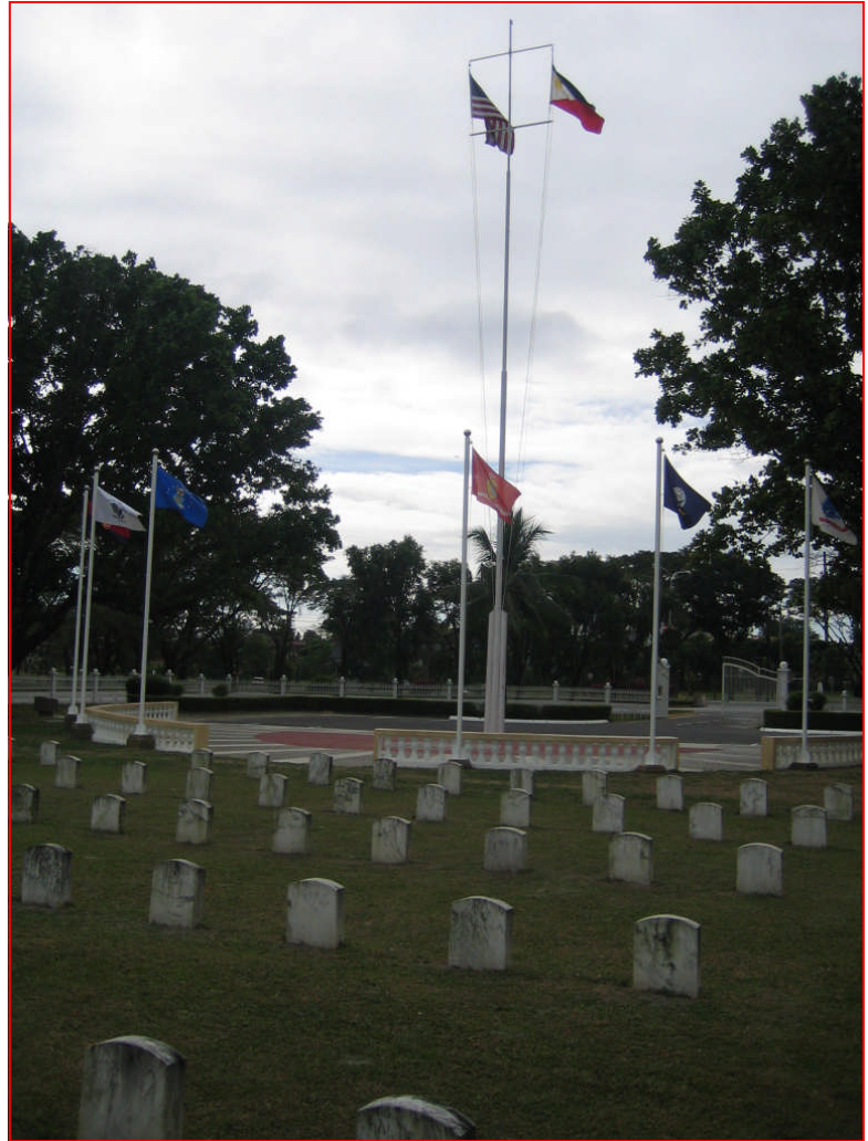
above: Memorial Plaza at Clark Veterans Cemetery. below: View of the cemetery with the Memorial Plaza in the distance.